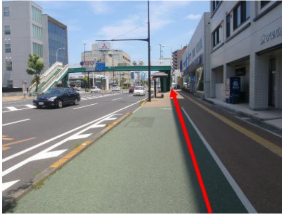
Just keep straight along “Kanko-dori Street 観光通り”.