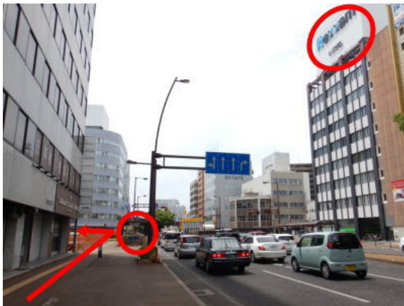
Turn left at a big crossroad named "Nakajin-cho 中新町" with an underpass and a big signboard of "Rexxam" on the right above.

After turning left, go straight along "Kanko-dori Street 観光通り".