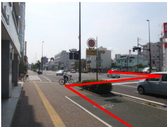
If you are going on the left side of street, cross it and keep right side.

Between this crossroad and wakabaya, you'll cross railways twice and see overbridges twice.