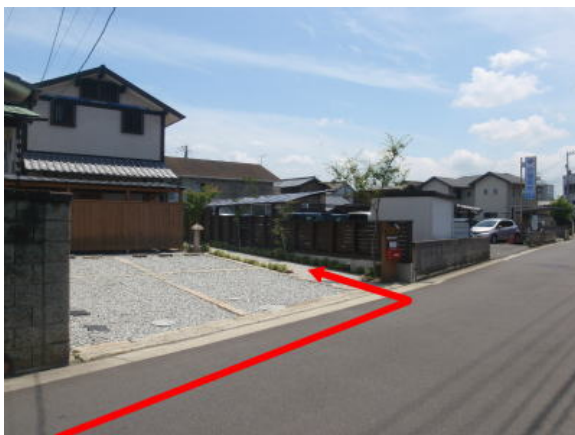
You'll find wakabaya 50m after that corner.