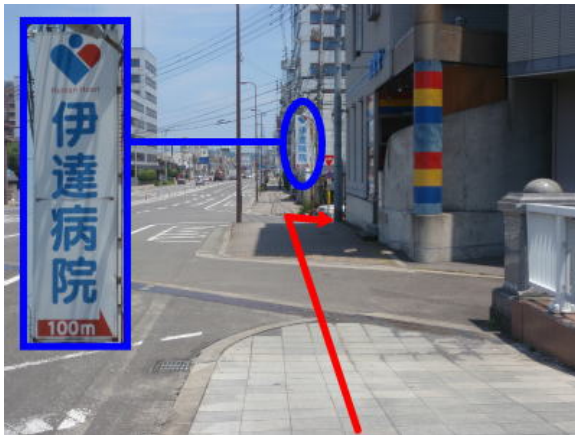
After the bridge, turn right at the corner with a signboard of “Date Hospital 伊達病院”.