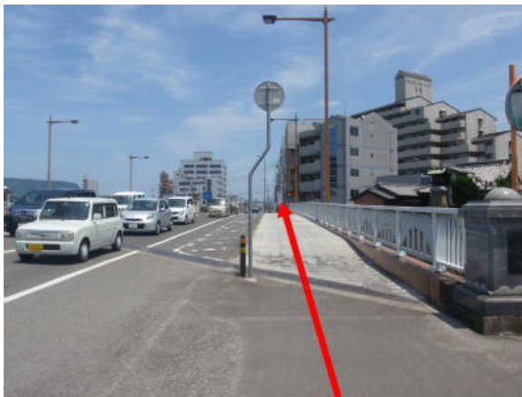
When you cross a bridge over a river, wakabaya is waiting you very near.