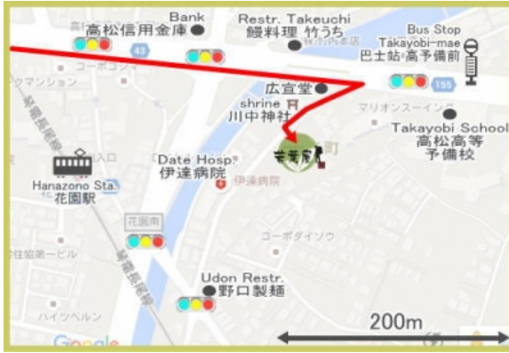
Map around wakabaya