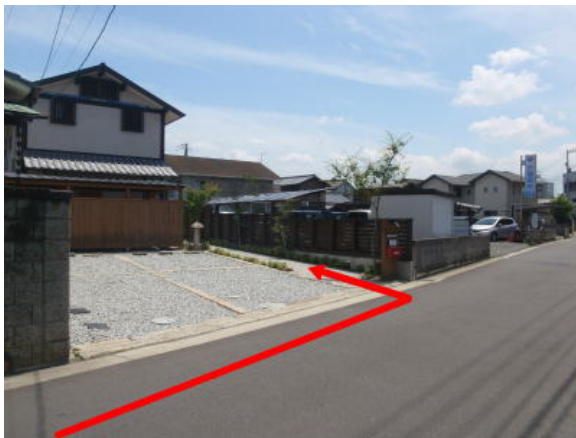
You'll find wakabaya 50m after that corner.