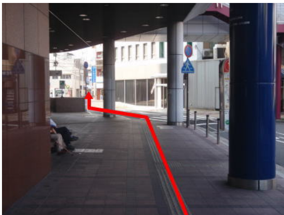
Go straight along narrow street.