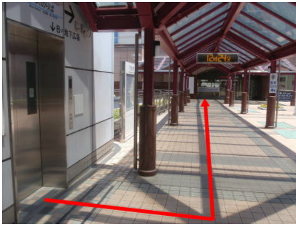
Go left side.