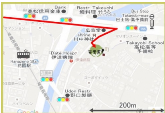
Map around wakabaya