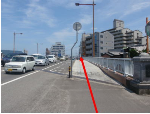
When you cross a bridge over a river, wakabaya is waiting you very near.