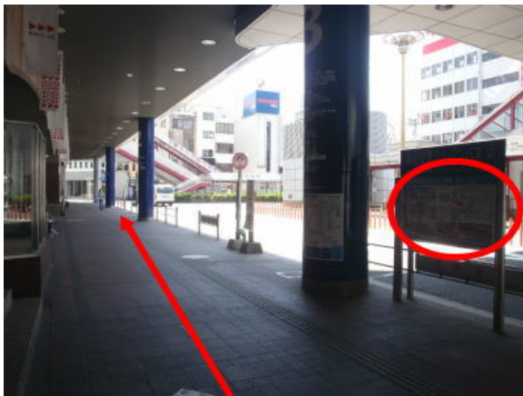
After the lift, go straight with seeing local bus stops.