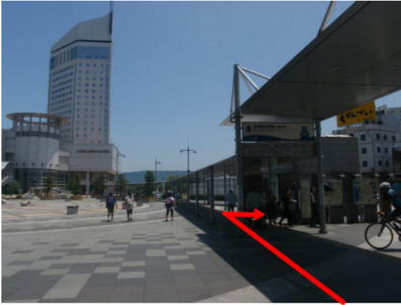
Going straight along the roofed passage shortly, on your right side you see a lift for a "Rent-a-Bicycle レンタサイクル" on the first basement.