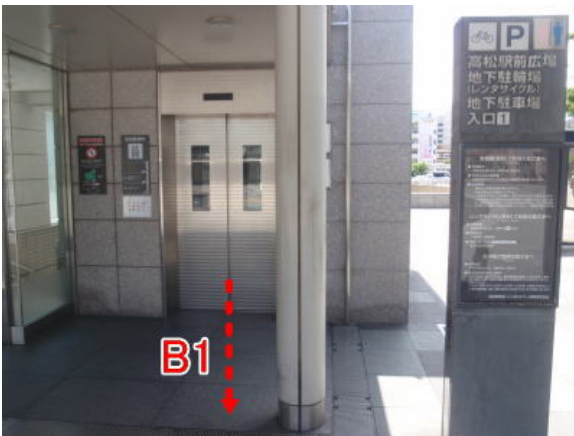
Go down to the first basement by lift.