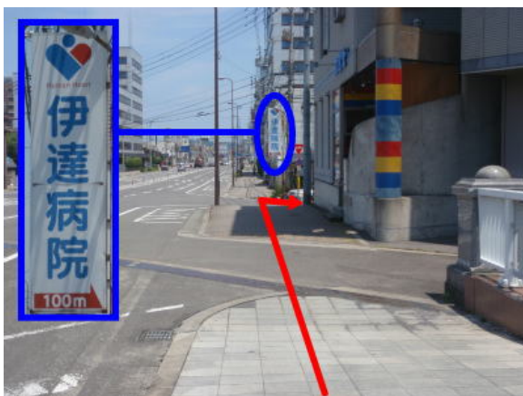
After the bridge, turn right at the corner with a signboard of "Date Hospital 伊達病院".