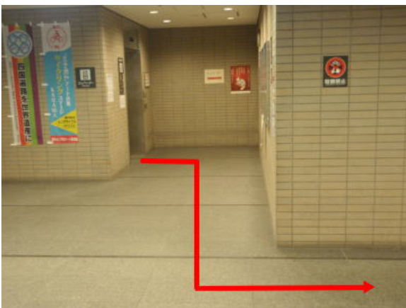
Getting off the lift, turn right and left.