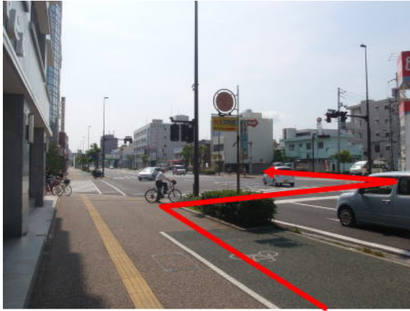
If you are going on the left side of street, cross it and keep right side.