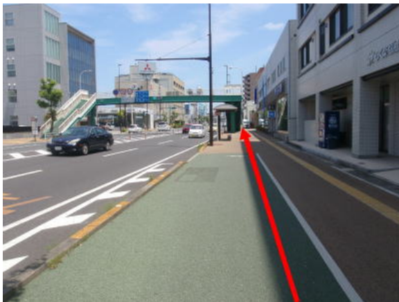
Just keep straight along "Kanko-dori Street 観光通り".